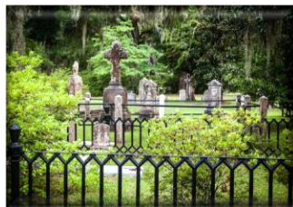
All Saints Church