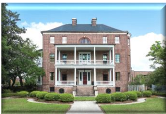
Joseph Manigault House