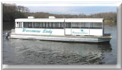
The Waccamaw Lady