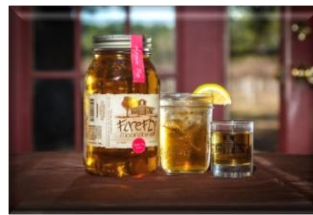
Firefly Tasting Room