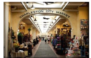
Charleston City Market