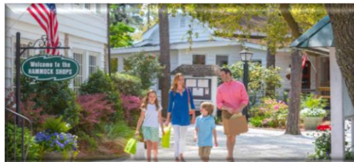
The Hammock Shops