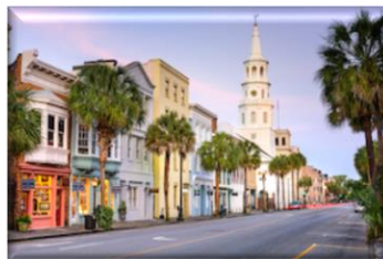
The City of Charleston