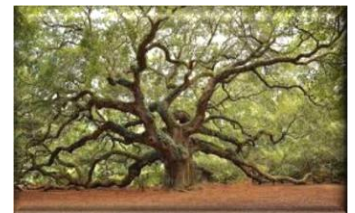
Angel Oak Tree