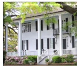
The Kaminski House