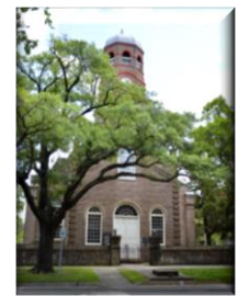
Prince George Church