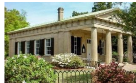
All Saint's Waccamaw